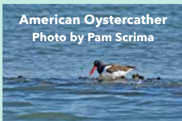
American Oystercatcher