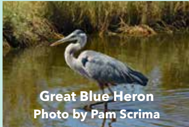
Great Blue Heron