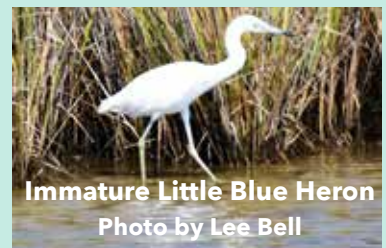
Immature Little Blue Heron