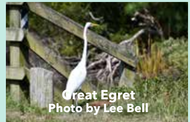
Great Egret