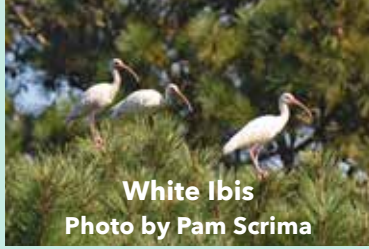
White Ibis

Eastern Phoebe White-eyed Vireo Red-eyed Vireo Blue Jay American Crow Fish Crow Purple Martin Tree Swallow Northern Rough-winged Swallow Carolina Chickadee White-breasted Nuthatch Brown-headed Nuthatch House Wren Carolina Wren Blue-gray Gnatcatcher Eastern Bluebird American Robin Gray Catbird Brown Thrasher Northern Mockingbird European Starling Cedar Waxwing House Sparrow House Finch American Goldfinch Chipping Sparrow Savannah Sparrow Seaside Sparrow Bobolink Eastern Meadowlark Baltimore Oriole Red-winged Blackbird Brown-headed Cowbird Common Grackle Boat-tailed Grackle Common Yellowthroat American Redstart Northern Parula Black-throated Blue Warbler Pine Warbler Scarlet Tanager Northern Cardinal Blue Grosbeak Indigo Bunting