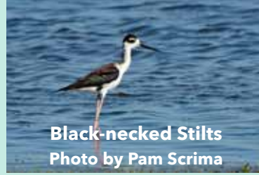
Black-necked Stilts