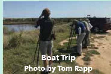
Boat Trip