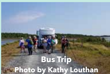
Bus Trip