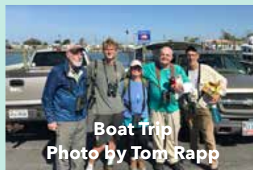
Boat Trip