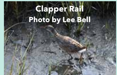
Clapper Rail