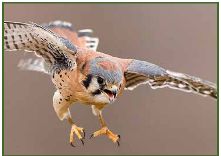
American Kestrel (photo from the web with no attribution)

AUG. 9, 2019 updated on November 5, 2019