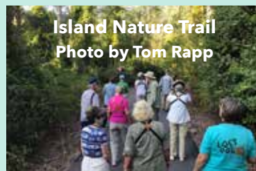
Island Nature Trail

WE'VE ALREADY LOCKED IN THE 2020 DATES, SEPTEMBER 18-20. MARK YOUR CALENDAR NOW AND PLAN TO JOIN US FOR SPECTACULAR BIRDING AT A REMARKABLE PLACE!