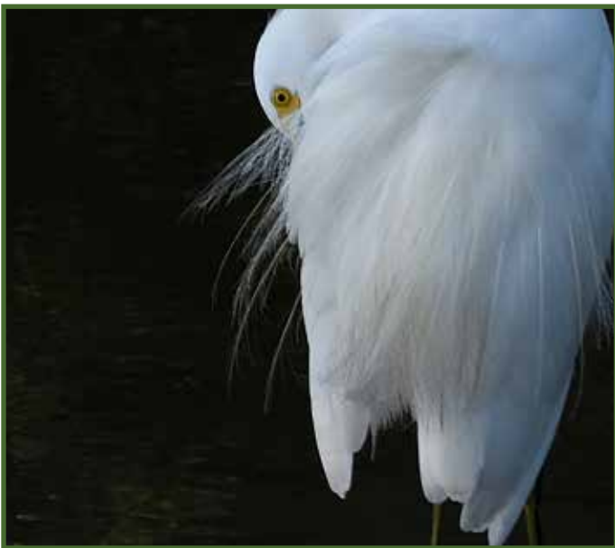
Great Egret

A list of James Eike Service Award honorees may be found on the VSO website.