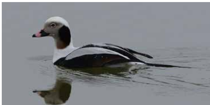
Long-tailed Duck