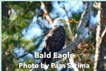
Bald Eagle