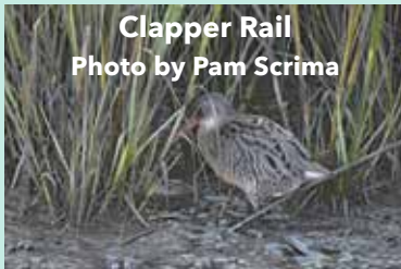
Clapper Rail