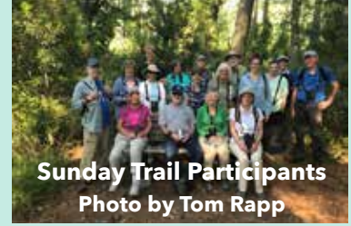
Sunday Trail Participants