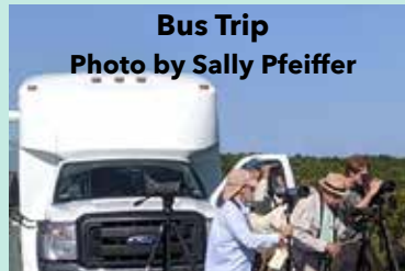
Bus Trip