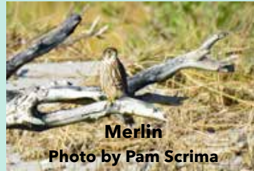
Merlin