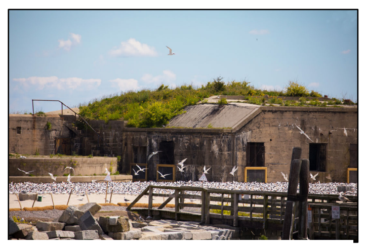
Royal Terns nesting at Rip Raps Island, May 2020, Photo by Meghan Marchetti, courtesy, VDWR

On December 22, 2017, the Department of Interior (DOI) Solicitor issued a reinterpretation of the MBTA, which declared that incidental take was no longer prohibited under the MBTA, thus removing this critical protection for birds. The U.S. Fish and Wildlife Service (USFWS) codified the reinterpretation in federal regulations on January 8,