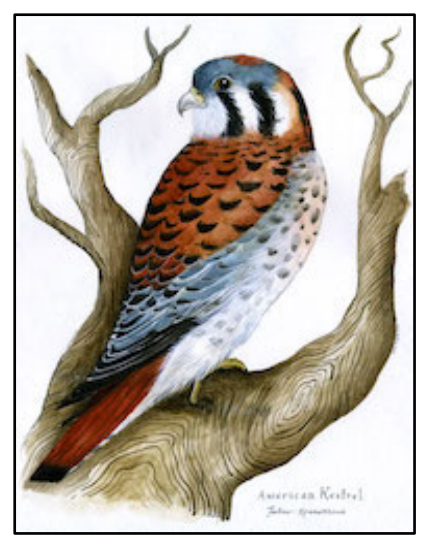
American Kestrel Painting by Diana Sudyka

By the start of 2021 we've been able to exceed our goal, with a total of 504 boxes in 46 counties around the state. With that phase of the project concluded, the effort going forward will concentrate on box